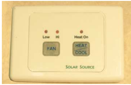
Wall Switch plate